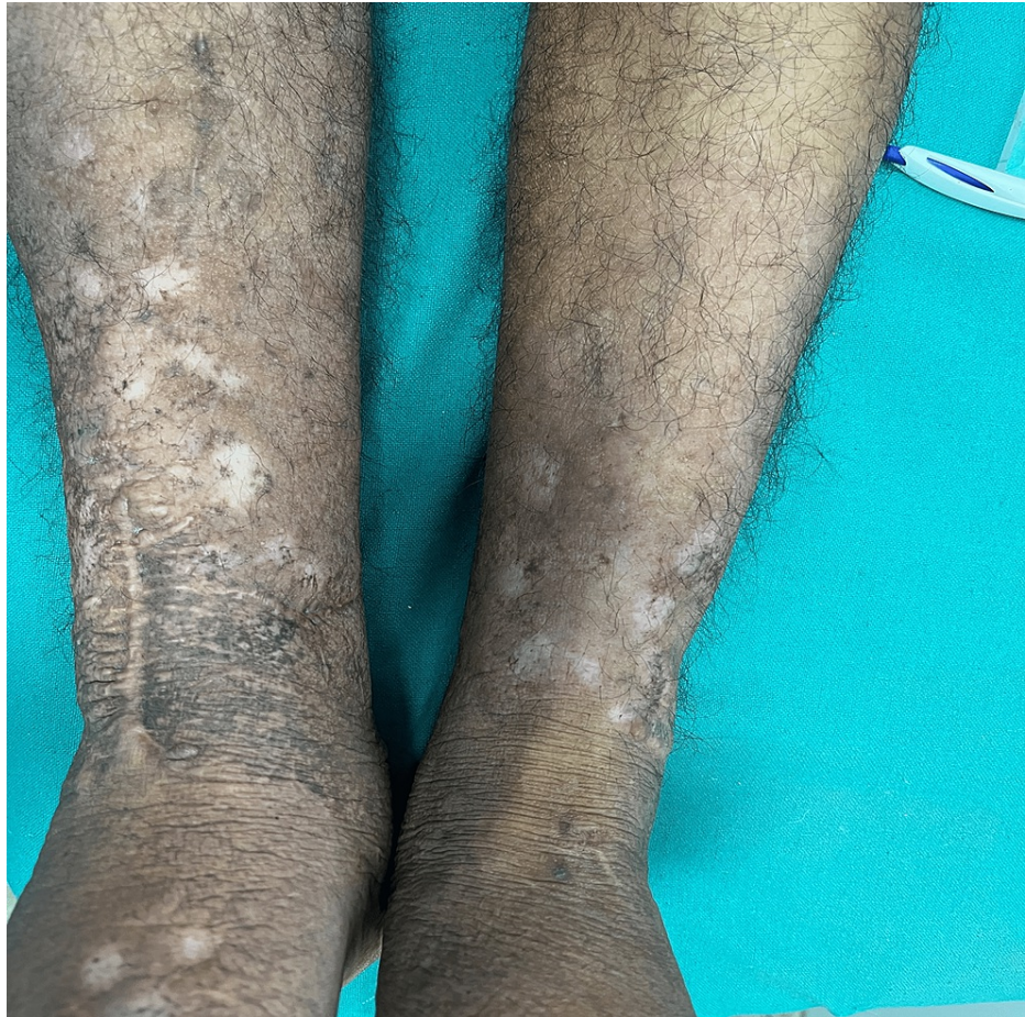
FIGURE 4: Recovery after four months of therapy with intralesional steroids