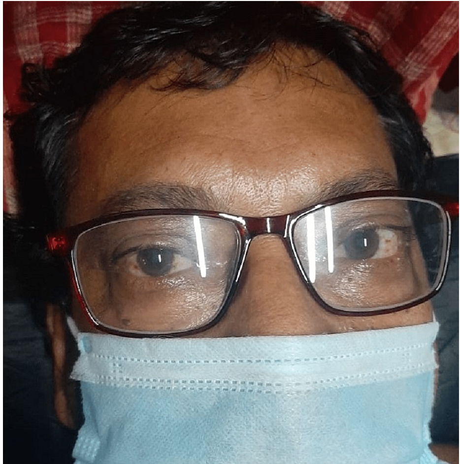
FIGURE 1: Graves' ophthalmopathy