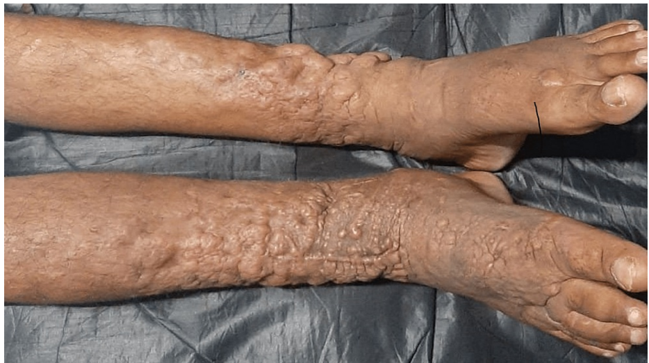
FIGURE 2: Multiple plaques and 'orange peel' on the anterior surface of both the legs, ankles, and feet

On histopathological examination, the epidermis showed evidence of hyperkeratosis along with deposition of mucin within the collagen bundles in the reticular dermis confirming the diagnosis of pretibial myxedema (Figure 3).