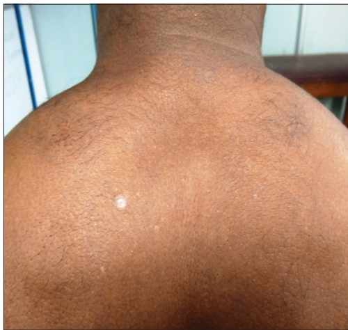
Figure 2: Localized non-tender swelling over both the shoulders