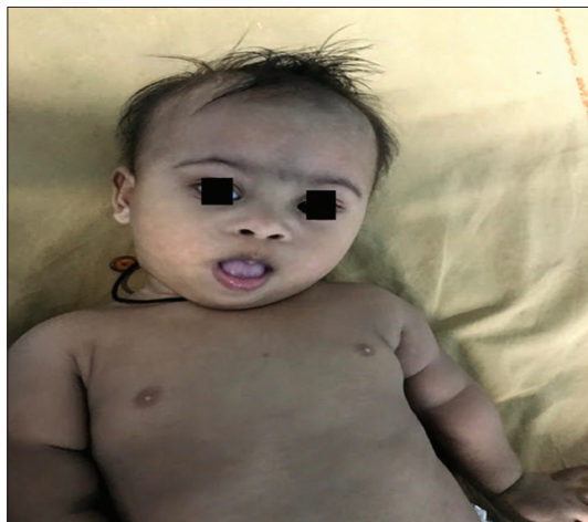
Figure 1: Clinical features suggestive of Down syndrome which included a depressed nasal bridge with flat nose, low set ears, protruding tongue, and epicanthic folds