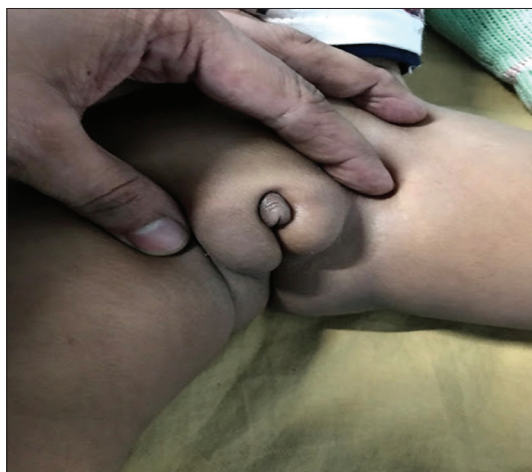
Figure 2: Micropenis, penoscrotal hypospadias, and incompletely fused labial-scrotal folds with palpable gonads